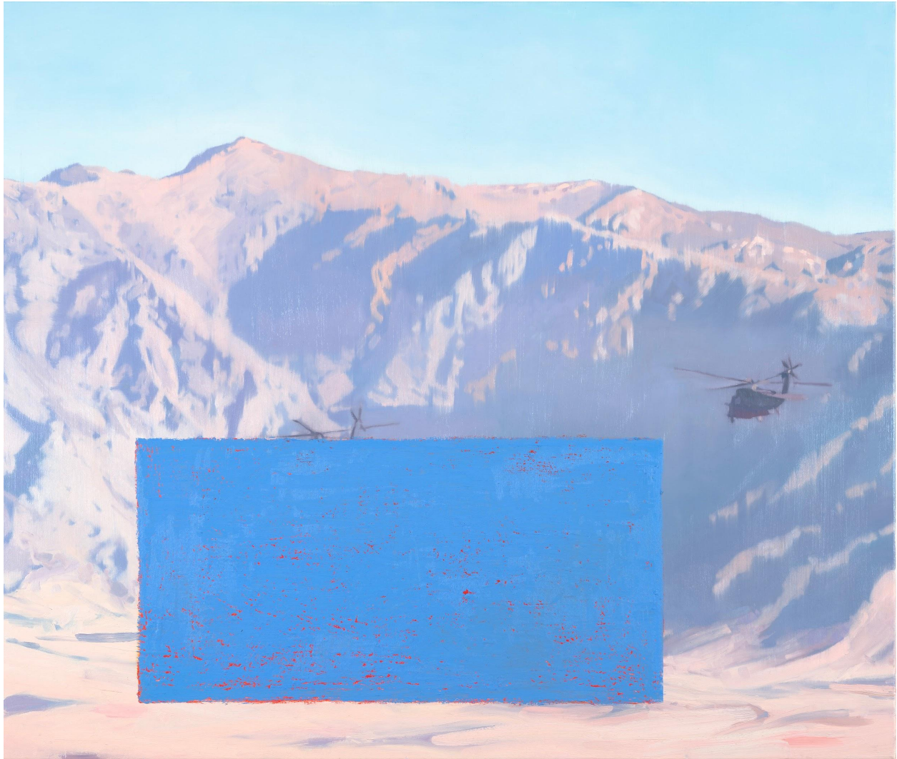
11. The Mission (redacted) #4 112 x 132cm oil and oilstick on canvas 2025 $6200