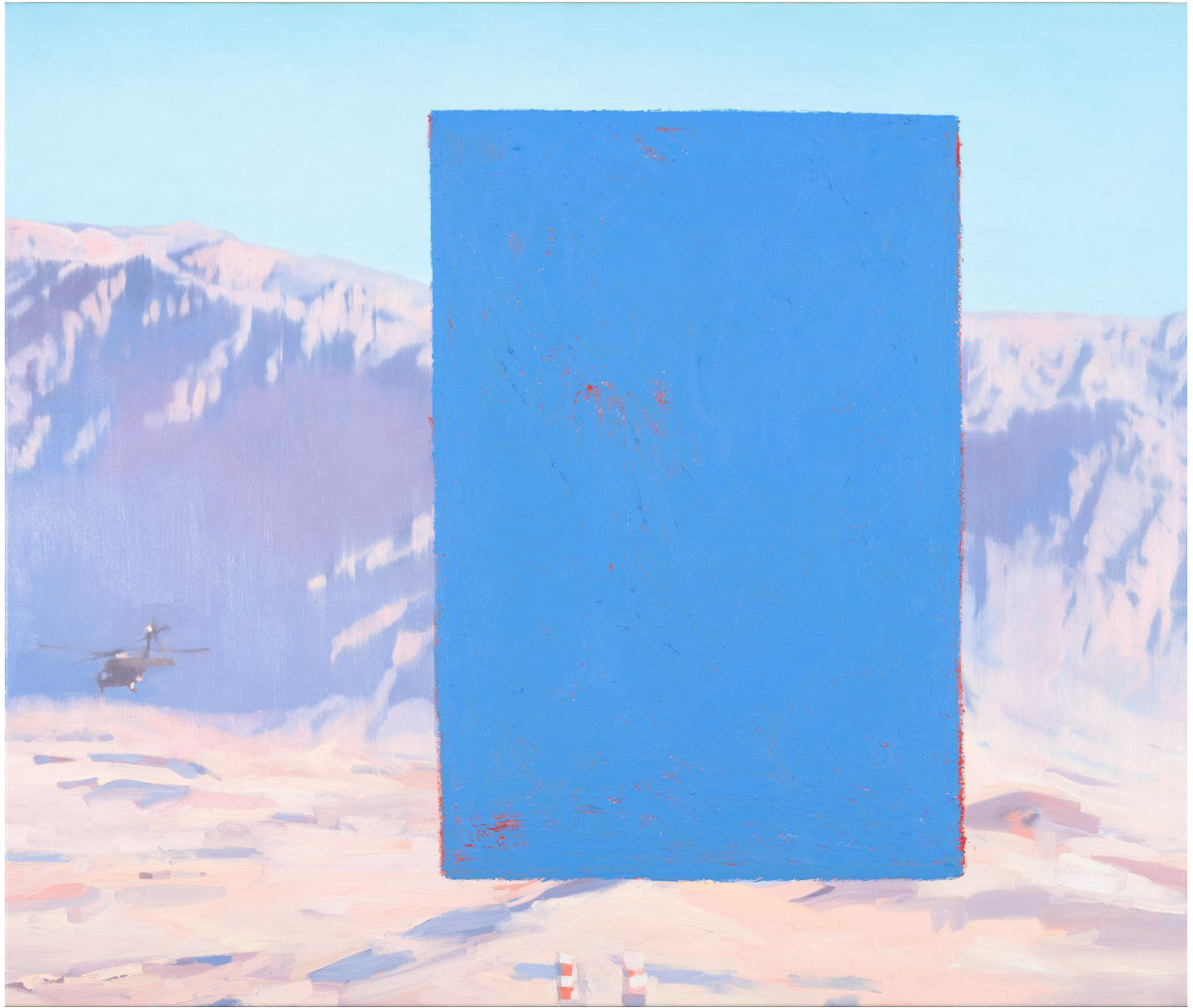
9. The Mission (redacted) #3 112 x 132cm oil and oilstick on canvas 2024 $6200