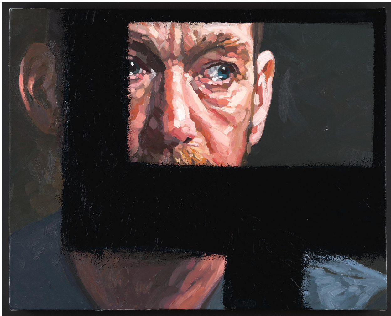
10. Ned 41 x 51cm oil and airbrush paint on canvas 2024 $2800