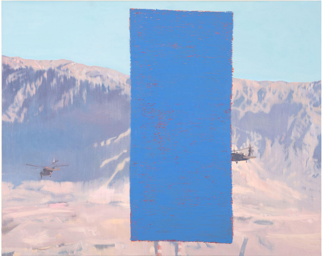
7. The Mission (Redacted) #2 100 x 125cm oil on canvas 2024 Sold