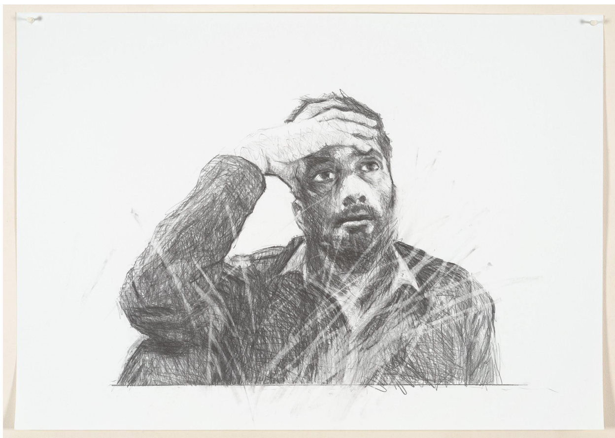
1. Erasure 60 x 84cm pencil on paper 2025 NFS